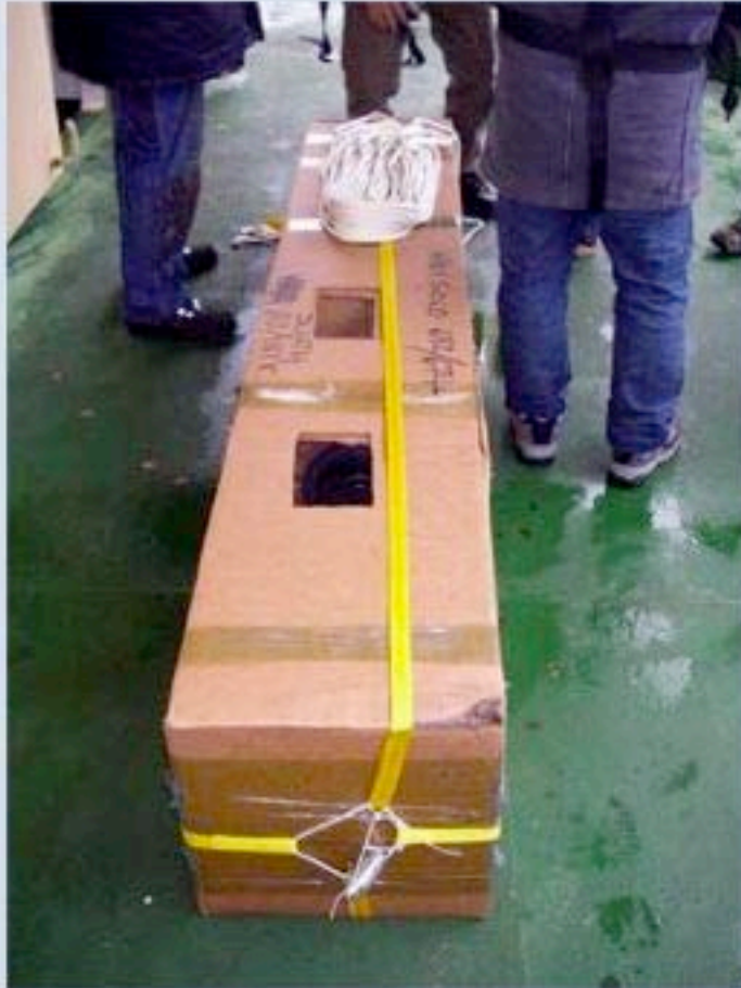
Launching the SOLO Probe