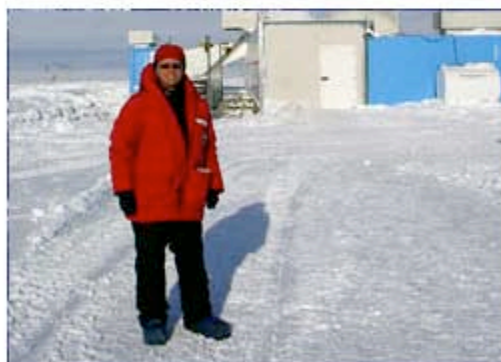
ANDRILL - Geological Drilling in Antarctica