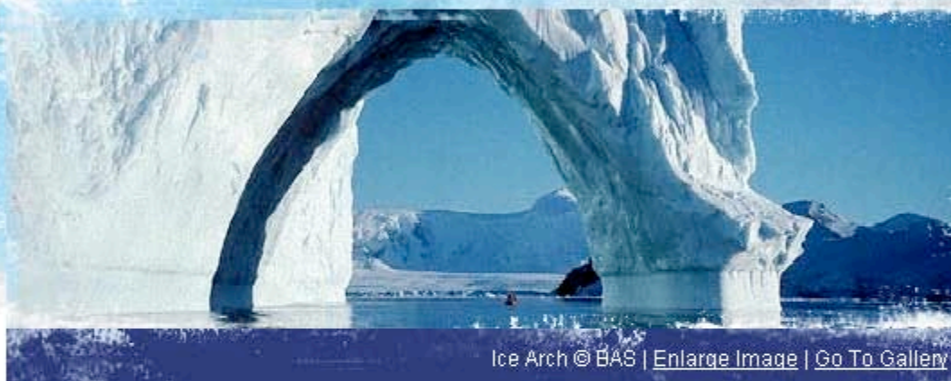
Ice Arch © BAS | Enlarge Image | Go To Gallery