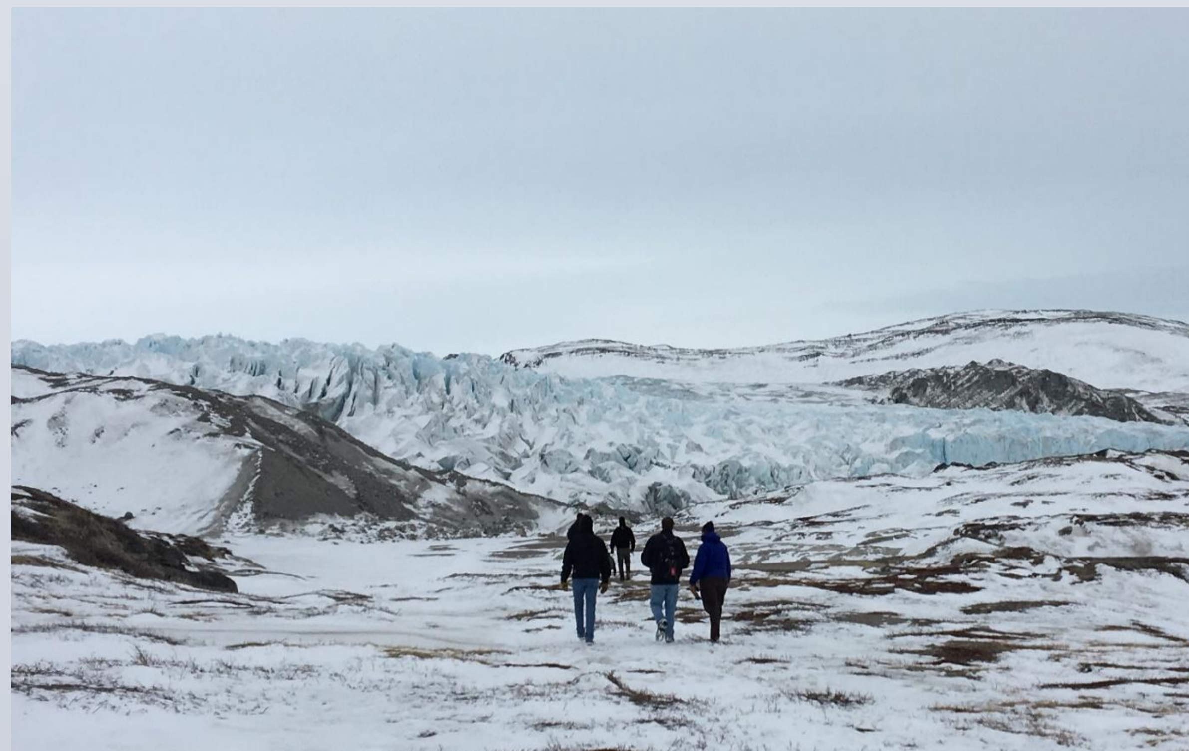
Exploring Russell Glacier with the IceBridge Crew.